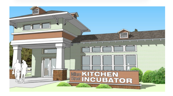
Submitted by the Housing Authority of Shreveport

HOUSING AUTHORITY OF SHREVEPORT SET TO OPEN MILAM STREET KITCHEN INCUBATOR