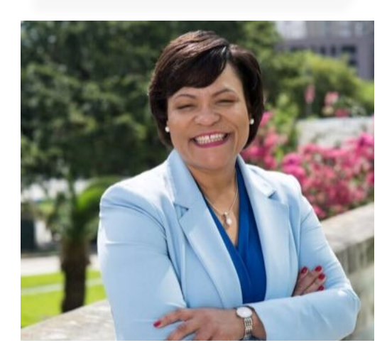
Featured in Fox 8 Live News Broadcast

MAYOR CANTRELL LAUNCHES AFFORDABLE HOUSING TOUR